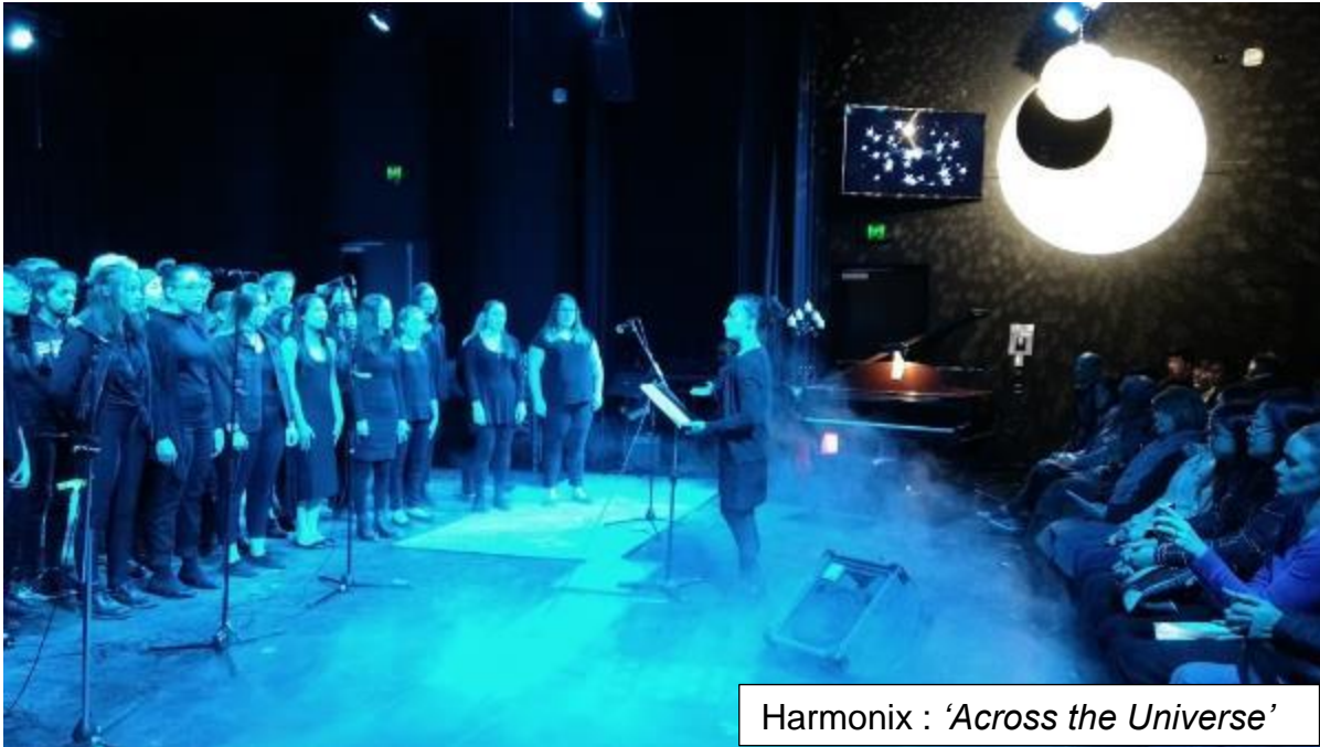
Harmonix : 'Across the Universe'

Last night, the annual Spring Concert was held in the College Theatre showcasing the work of the more senior performance groups of the instrumental music program. The HSC Orchestra, Chamber Strings, Highvale Harmonix, Stage Band, Sticks tricks, Flute Choir, Brass Ensemble and VCE solo performance students presented musical items ranging from 1940's Big Band standards to a massive 87 piece orchestrated medley of music from the James Bond movies.