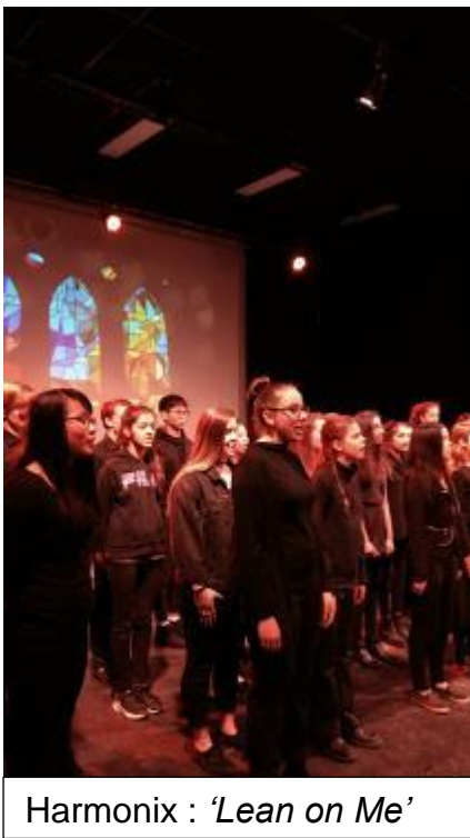
Harmonix : 'Lean on Me'

The evening began with the Stage Band performing a version of the heavy metal 'Enter Sandman' and was followed by a series of soloists and ensembles accompanied by some exciting visual effects.