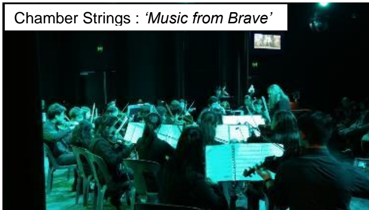
Chamber Strings : 'Music from Brave'

Congratulations to all the student performers and a big thank you to our instrumental music staff and the students and staff of our stage crew who always do a wonderful job. The high standard of performances were a direct result of the hard work and effort of both our student musicians and instrumental music staff.