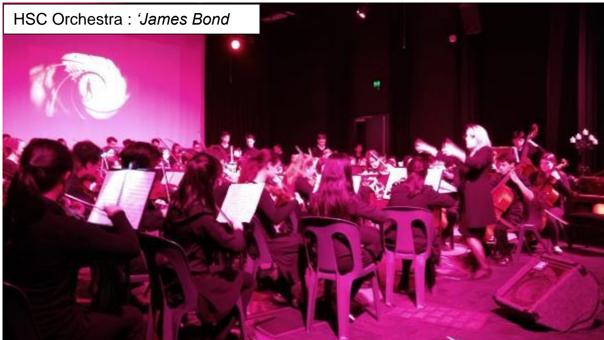
HSC Orchestra : 'James Bond'

Our junior performers will have an opportunity in Term 4 to present their work at the Junior Concert on November 16 th . The concert will involve the String Orchestra, Rhythm Riders, Junior Stage Band and Highvale Hamonix.